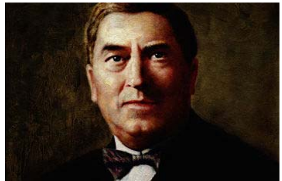
Maurice Duruflé (1902-1986)

A reception to honor the artists will be held immediately following the concert. Website: connectatstjohns.org .